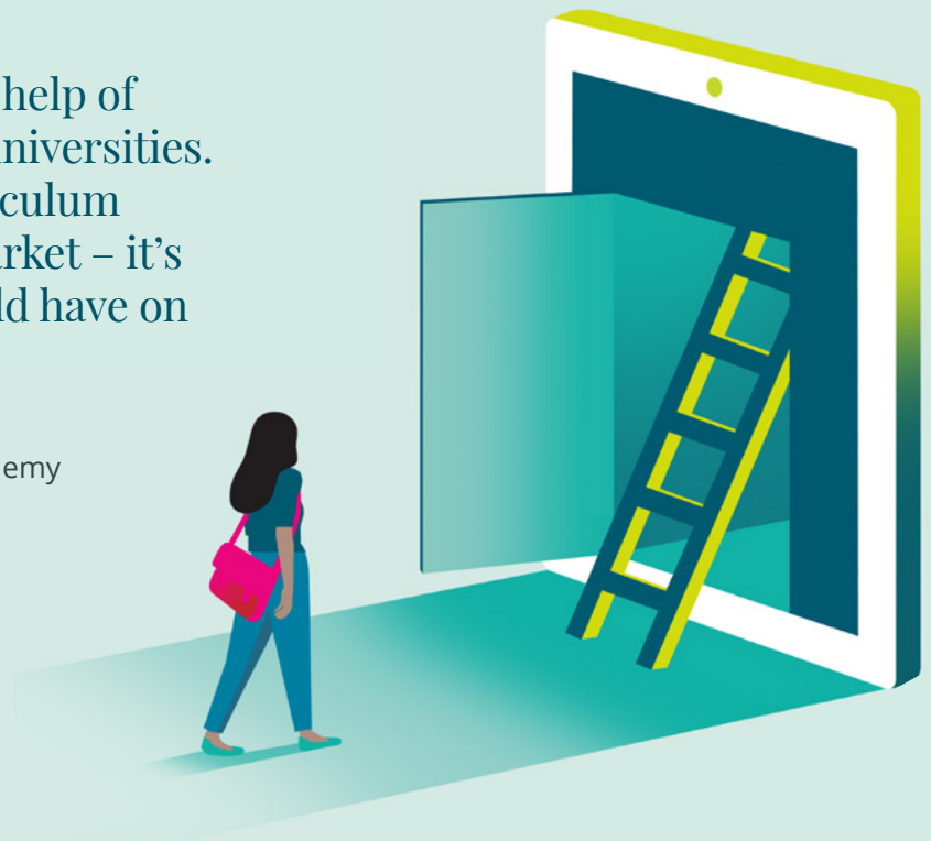
Illustration by Lucy Vigrass