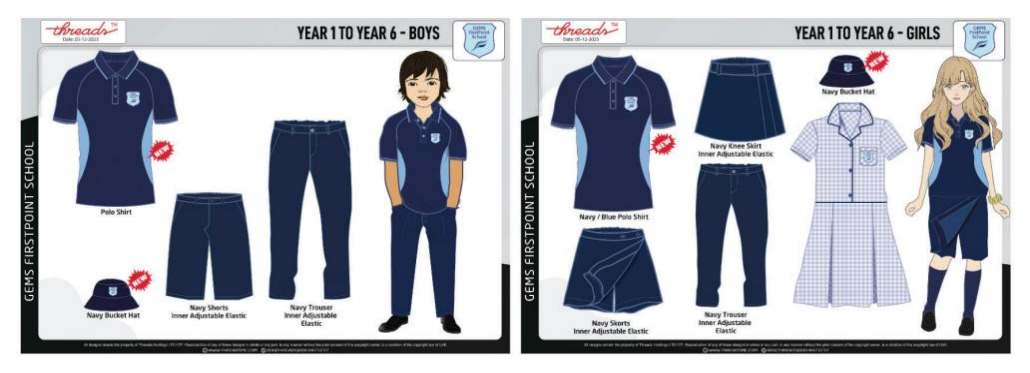
Year 1 - Year 6